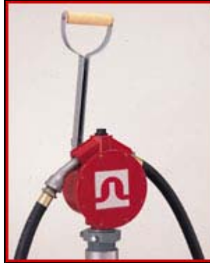
Series 5200 Piston Hand Pump Shown FILL-RITE