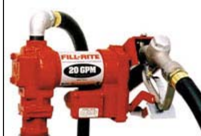
Model 1210C Battery Powered Pump Shown