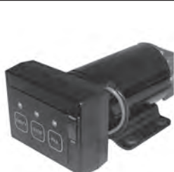
GPB Gear Pump