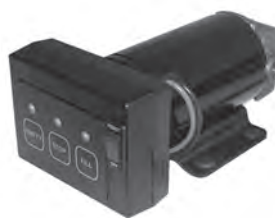
GPBRT Reversing Gear Pump Touchpad Control