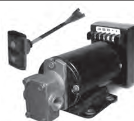
GPBR Reversing Gear Pump Remote Location Control

Concept: GROCO gear pumps are positive displacement pumps, capable of operation in either direction. They may be used to perform a variety of on-board duties such as fuel transfer, engine oil change or ballast trim (DO NOT USE FOR GASOLINE or other combustible fluids).