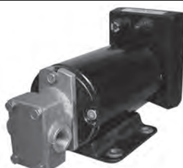
GPBR Reversing Gear Pump Toggle Switch Control