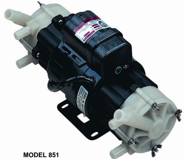
MODEL 851 ASS'Y NO. 0851-0001-0100