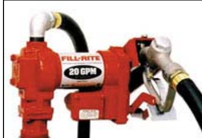
Model 1210C Battery Powered Pump Shown