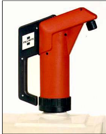
Model FR20 Shown