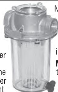
ARG-P SERIES with Non-Metallic Filter Basket

Non-metallic Filter Baskets: GROCO® offers ARG-P series strainers with non-metallic filter. The corrosion-proof non-metallic baskets are an advantage in continuous running or high usage installations such as air conditioning, generators, or refrigeration systems where the continuous flow of sea water shortens filter basket life.