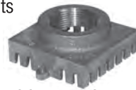
BS Series Bilge Strainers are available in sizes from 3/4" to 3" NPT

Side Port: SBV-P Side Port is threaded NPT, one pipe size smaller than the top and bottom ports. The side port must be closed with a valve (GROCO IBV Series). After the valve other components may be added, such as a bilge strainer (GROCO BS series), or an engine flush kit/safety seacock conversion (GROCO SSC series).