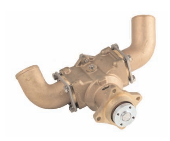
P2703-01, P2705-01, P2709-01