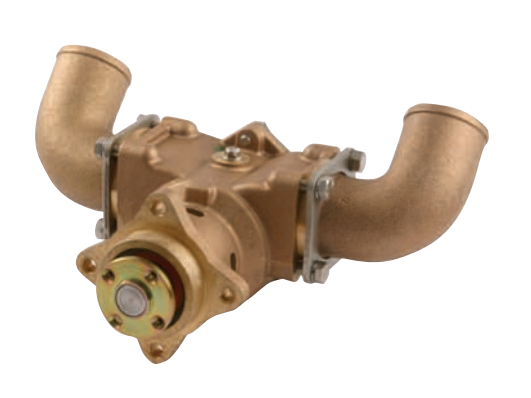
P2701-01, P2704-01, P2708-01