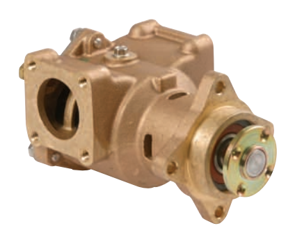
P2701X, P2702-01, P2706-01, P2708X, P2710-01